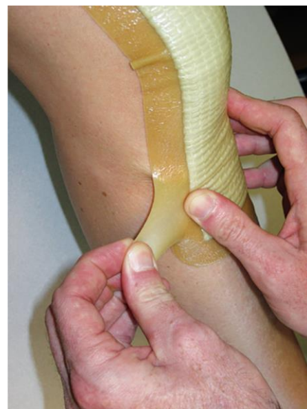
This bandage is beige without a honeycomb structure (it is "solid").

Questions or doubts? Call 811 (Info-Santé, 24 hours a day, 7 days a week) or call the nurse at your CLSC.