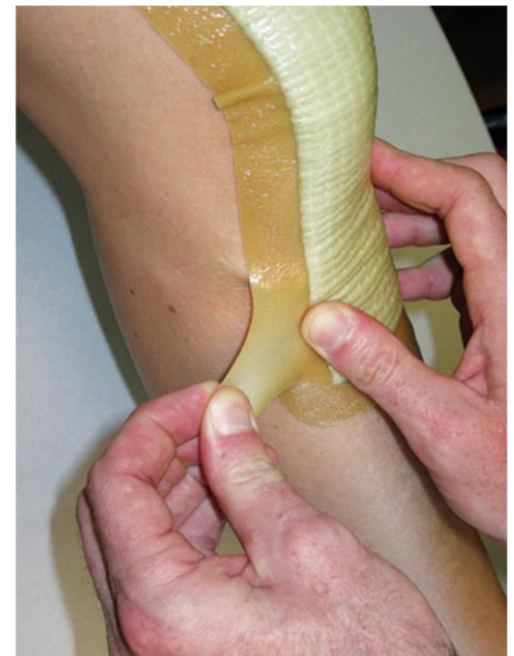
This bandage is beige without a honeycomb structure (it is "solid").

Questions or doubts? Call 811 (Info-Santé, 24 hours a day, 7 days a week) or call the nurse at your CLSC.