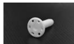
Smit sleeve 1

When we take you to the operating room, the person accompanying you can go to waiting room number 4 in radio-oncology, in the basement (SS). We will find and notify this person when you have returned from the recovery room.